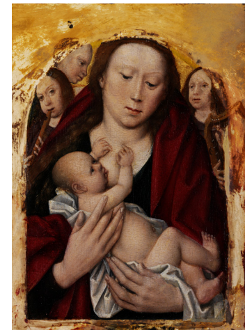
Virgin and Child, oil painting, Robert Campin, 15th century. Museum No. 769:1-1865.