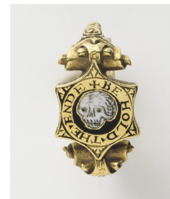
Ring, unknown maker, 1550 – 1600. Museum no. 13-1888.