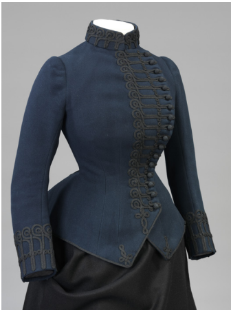
Riding habit jacket, John Redfern & Sons, 1885-1886. Museum no. T.430-1990.