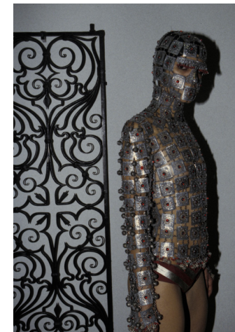
Fashion in Motion: Alexander McQueen and Shaun Leane, October 2001.