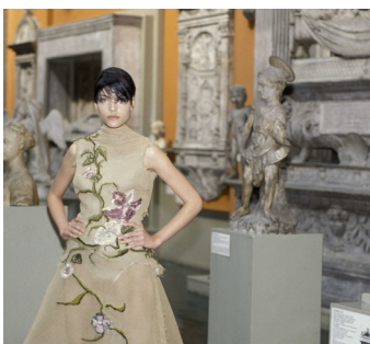
Fashion in Motion: Alexander McQueen, 1999.