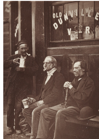
The "Wall Worker", Museum no. PH.332-1982.