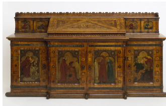
King René's Honeymoon Cabinet, 1861. Museum no. W.10:1 to 28-1927.