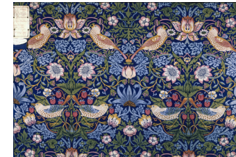
Strawberry Thief, furnishing fabric, William Morris, 1883. Museum no. T.586-1919.