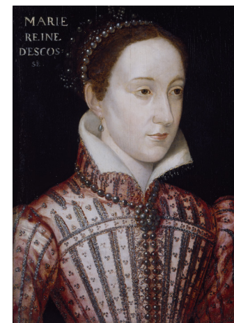
Portrait of Mary Stuart, Queen of Scots, Francois Clouet, 17th century. Museum no. 625-1882.