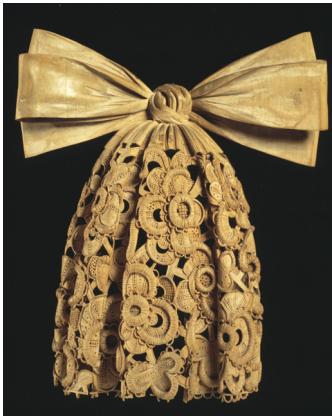
Carving, Grinling Gibbons, about 1690. Museum no. W.181:1-1928.